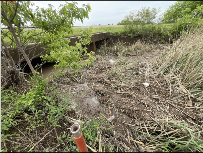
Vegetation on left end

Vegetation on left end partially blocking channel flow.