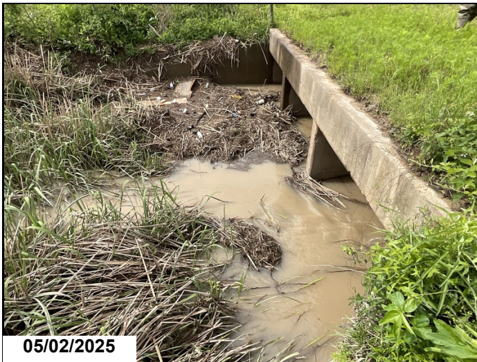
Drift at inlet end